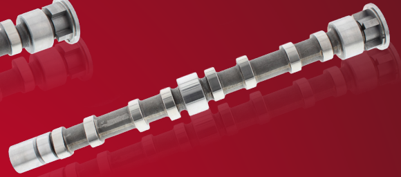
C396 - EXHAUST CAMSHAFT