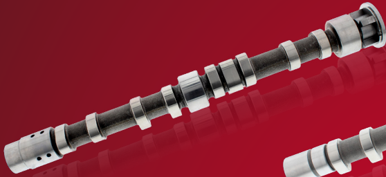
C394 - INTAKE CAMSHAFT